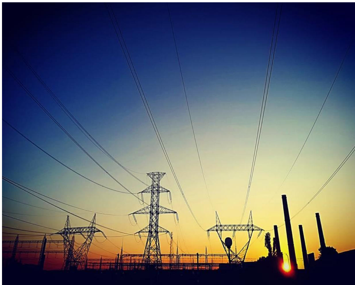
Bucharest South Station